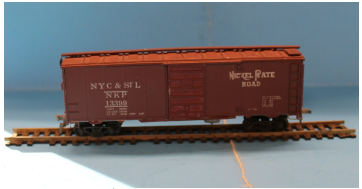
Paul Lessard's 1/87 th Model Die Casting 1937 AAR Nickel Plate Road Boxcar, built "out of the box"