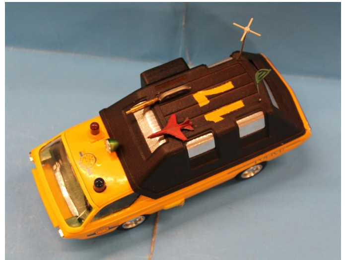
Chuck Converse's 1/25 th AMT/ERTL Show Van converted to a futuristic police command car