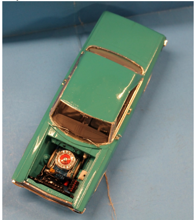
Tony D'Anjou's 1/25 th Moebius 1965 Plymouth Satellite: a nice kit with a nice rattle can paint job