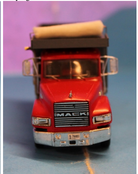
Paul Lessard's 1/87 th HERPA 1990's Mack CH Dump Truck with scratch built dump body and exhaust stack